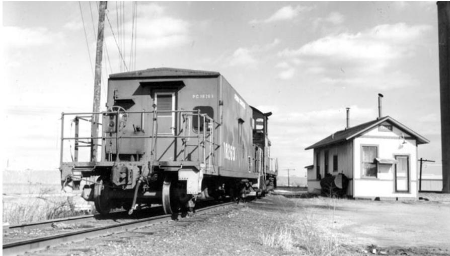
Truro - This 1975 Galen Gonser photo from Columbus Railroads Towers and More Site , shows the East Columbus local, with a Penn Central liveried switching and terminal caboose and what appears to be an SW7, sitting on the former CS&H/Z&W right-of-way just west of the T&OC main track switch.

South of Main, the rails curved southeast through Whitehall and across Livingston Avenue, running between Vilardo and Bostwick Streets, to Truro (originally called Burt's) near the present-day Landmark grain elevator near the intersection of Hamilton Road and Interstate 70. From Truro, the line ran east through Brice, Pickerington, Basil and Baltimore to Thurston. From there the line edged around the south shore of Buckeye Lake, crossing the B&O's Newark, Somerset & Straitsville line at Walser, and on through Mt. Perry, Glenford and Fultonham to Zanesville.