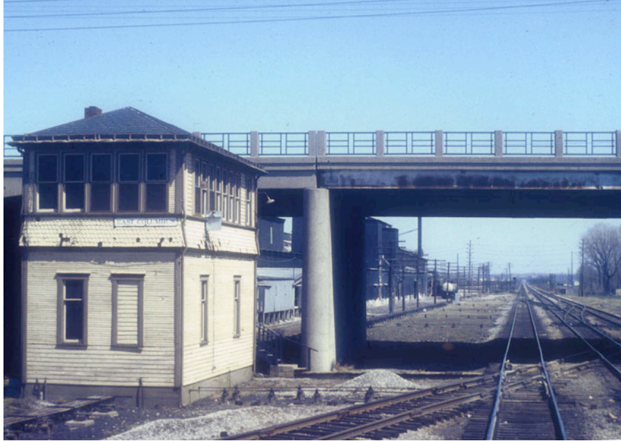
East Columbus Tower and Junction - John Fuller photo from the Columbus Railroads Towers and More website. This place was called Alum Creek Junction in the 1880s - not to be confused with the latter-day Alum Creek Tower on the B&O 1.5 miles to the west where the B&O crosses the N&W. This view shows the B&O three-track C&N line, shared by the Pennsylvania Railroad Panhandle main line, running beneath James/Stelzer Road due east toward Newark, with the former Z&W track angling across from left foreground to the right toward Truro. The Davco Fertilizer plant is to the left, and trees ahead to the right of the B&O right-of-way are on the Defense Supply Center campus. Z&W's small yard was just out of view to the right. The B&O-PRR's 5 tiny three-track livestock rail yard was behind the photographer to the right.

Beyond the diamond at East Columbus, the line ran southeast past a small four or five-track Z&W freight yard into the area that became the Defense Supply Center in 1918, curving through the site of the U.S. Army Officers' Club golf course built in the 1940s (now called the Eagle Eye Golf Course). In the 1960s the railroad was literally on the fairway or just in the rough on what were then holes Nos. 2, 3 and 5, with golfers occasionally dodging the Local's slow-footed SW7s. For a time, golfers teeing off on hole No. 3 hit straight across the right of way. From the golf club, the line turned due south, transiting a big warehouse area on the military base, and then across Broad Street by the former Creith Lumber and the exotic Kahiki Restaurant site at Napoleon Avenue. This area was originally the village of Doney's, where there was a station and an at-grade crossing with the east-west Columbus, Newark & Zanesville interurban line. From Doney's, the line ran just east of and parallel to Napoleon Avenue across East Main Street, where there was a switching lead into Cotton Lumber, which operated here for many decades. Between Broad and Main, the tracks (and now their remnant earth berm) constitute the city boundary between Columbus and Whitehall.