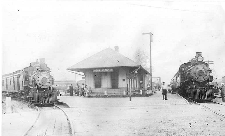
Z&W and T&OC Thurston Station - Formerly called Bush's Station and later Hadley Junction, Thurston was a large and busy station at the Z&W junction with the T&OC's Eastern and Western Branches.