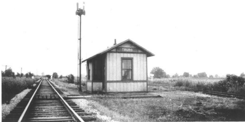
Truro, summer 1940. Looking west on the T&OC toward Bannon; the East Columbus Branch is visible to the right.

During the mid-1890s the character of this operation changed dramatically. In 1894-5, the principal CS&H affiliate, the T&OC, which previously reached downtown Columbus via Alum Creek Junction and over the B&O/PRR, built a connection into Columbus westward from Truro across the N&W at Bannon, through South Columbus and up the Scioto over Miami Crossing to its West Columbus Yard on McKinley Avenue, connecting with the recently-completed T&OC Western Branch to Toledo. This enabled the T&OC to move Columbus coal traffic directly on its own line instead of interchanging it to other railroads. In 1903, the T&OC acquired the Z&W and established its own Columbus passenger depot and freight house on West Broad Street. Under the T&OC, passenger and freight traffic into Columbus from Truro moved over to the South Columbus line and away from the old CS&H route up through East Columbus and Shepard and the CS&H freight house on Mt. Vernon Ave.