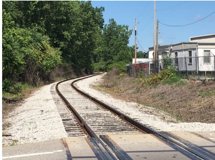
TRACK BACK IN SERVICE! - Z&W (East Columbus Branch) looking west from Woodland Ave. This refurbished section connects a shipper facility at Brentnell Ave. to an interchange with the Ohio Central (former Panhandle/B&O line) via a remaining fragment of the former CA&C.

In the Columbus Railroads November 2016 Photo of the Month, an aerial view of the Joyce Avenue Yards which prompted me to write this piece, there is a fragment of the Z&W track barely visible in the lower right corner of the view, which comes into better definition if you use the magnification tool. This is the small bit of Z&W track marked as “Track out of Service” on the 1934 Unification Committee Map. Ironically, this Z&W fragment between Brentnell and Woodland Avenues, and the track westward from there to Milo (which was sold to the PRR in 1903) is once again active, serving an industrial shipper’s 20+ car storage yard near the Brentnell-Leonard Ave. intersection.