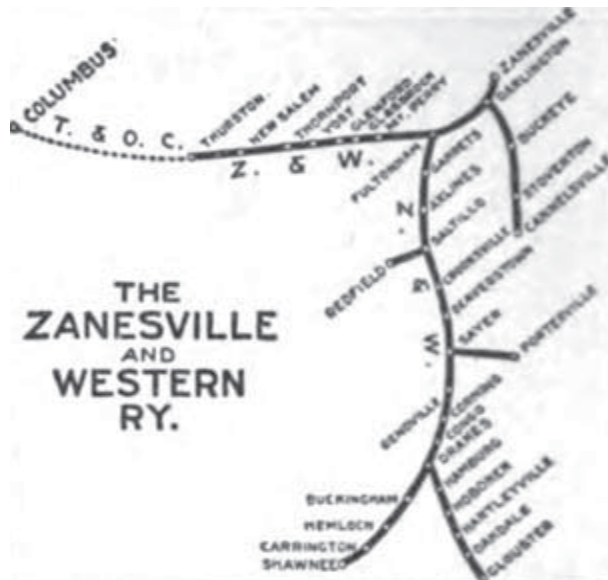
Z&W – 1904 Official Railway Guide

There were also three smaller Z&W branches serving many active coalmines that dominated this region from the 1880s to 1950s. The Brush Creek Branch, built in 1886, ran south from Muskingum, forking at Cannelville and reaching several mines and smaller communities beyond. From about 1900-1930, the San Toy branch ran south from Sayre for several miles through a tunnel to the town of San Toy, a major coal producer in that era. (For interesting old photographs and information about San Toy, see the Little Cities of Black Diamonds website.) At least one 1898 Ohio rail map shows a branch of the Z&W predecessor CS&H running east from Sayre through Porterville and Triadelphia to Shawnee Junction on the B&O, just north of McConnelsville in Morgan County. This branch, formerly part of the Shawnee & Muskingum River Railroad that the CS&H acquired as part of its 1890 southward expansion, appears on Ohio rail maps up through 1902 but is not present on a 1906 resource map available on the Columbus Railroads site. From the 1890s until some point in the 1930s, another small Z&W track called the Buckeye Branch ran off to the southwest from Saltillo through Redfield, forking southeast and northwest from that point to reach now-long disappeared mines and small villages.